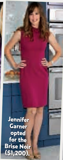
Jennifer Garner opted for the Brise Noir ($1,200).