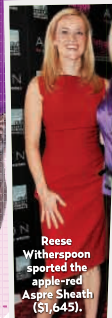
Reese Witherspoon sported the apple-red Aspre Sheath ($1,645).